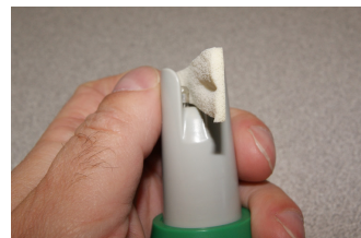
Wipe back and forth with the foam